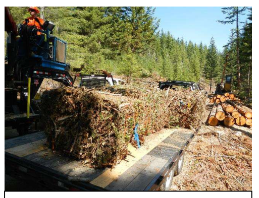
Figure 5. Forest residuals bales produced by utility baler from roadside windrows on Snogualmie National Forest.