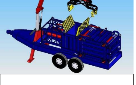
Figure 1. Concept rendering of forest utility baler on straight trailer and with 17-ft reach self-loader.

An objective of the Biomass Research and Development Initiative (BRDI) forest residues collection task team is to