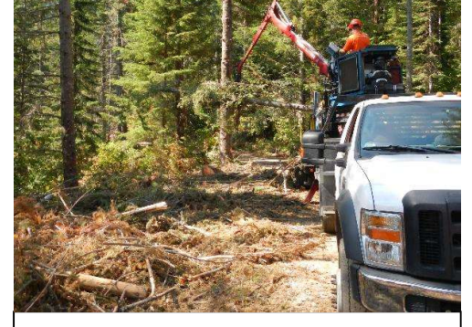
Figure 4. Forest Concepts' engineering prototype forest utility baler collecting forest residuals from roadside windrows on Snoqualmie National Forest.

the forest utility baler is designed to maximize trucking payload, minimize bale yard requirements, and be handled by lightweight skid-steer loaders as well as conventional agricultural bale handling equipment. Each bale is expected to weigh between 400 – 550 kg (900 and 1,200 pounds) depending on moisture content. The bale weight specification is constrained in-part by lifting limits for skid-steer loaders used in the forestry and vegetation management industries.